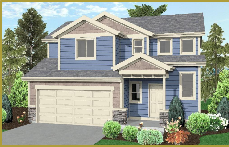
Shown with Optional Stone Veneer